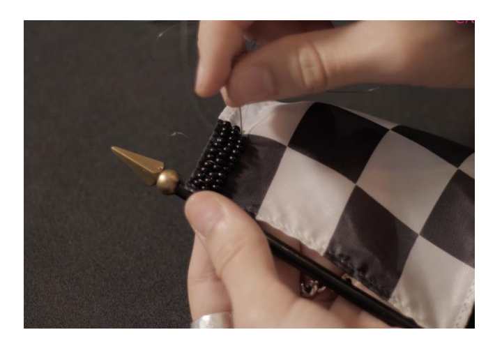
Step 4 Lastly, in order to secure the line of beads you just added, you will need to stitch every other bead in your line. To do this, you will bring the needle back up from the bottom and stitch in between each bead that you just laid down. Once you have the first row of beads laid out and secured in the position you want, you can then begin a second row or create different patterns.

With your needle, pick up however many beads you would like to use. You can choose 4-5 beads or more, depending on what you are working on. After they have been inserted through the needle and thread, you will lay them down where you want them to be on your fabric. To secure the beads you just added, you will insert the needle next to your last bead or the end of your line of beads, and pull the needle and thread back down through the fabric.